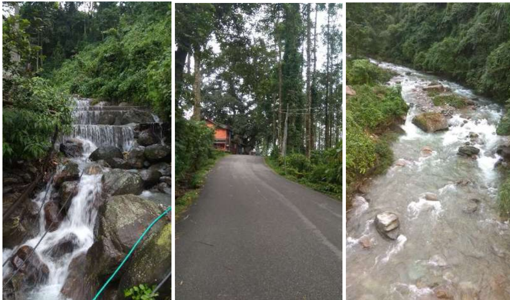
Fig. Natural beauty in and around the Gorubathan