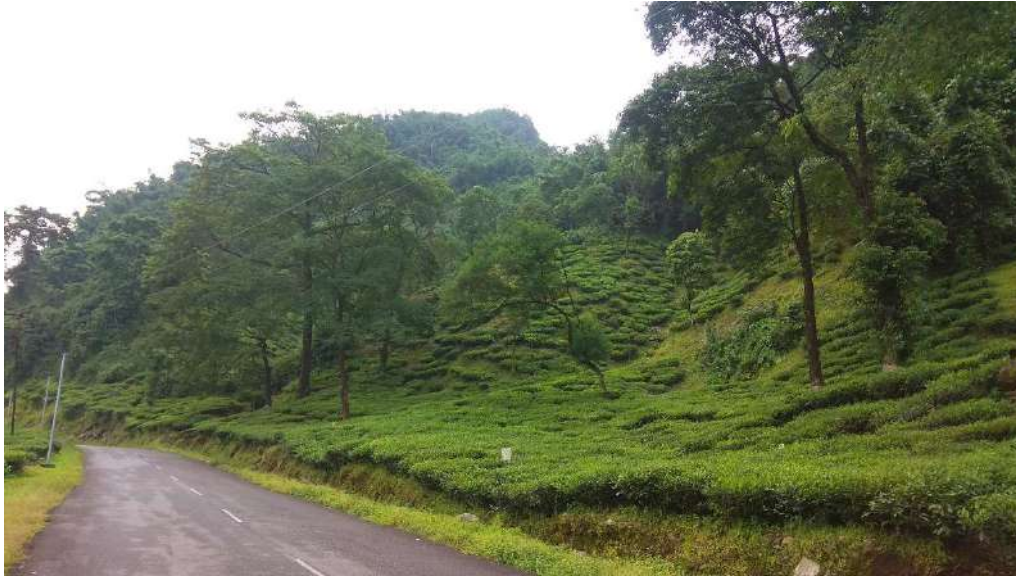
Fig. Ambiook Tea Garden